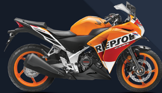
NEW REPSOL RACE-REPLICA