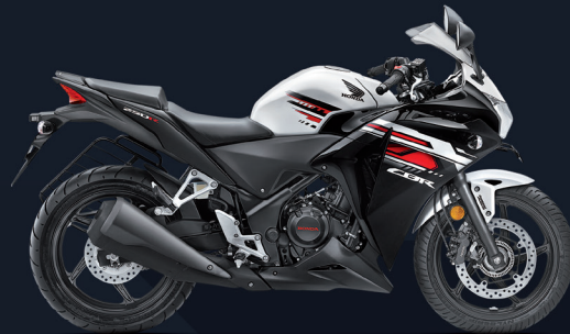
PEARL AMAZING WHITE