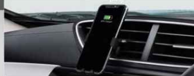
NEW WIRELESS CHARGER FOR SMARTPHONE

With choice accessories crafted in chrome, you can personally customize the New Amaze to make it every bit you.