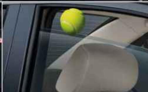
DRIVER SIDE WINDOW ONE TOUCH UP/ DOWN WITH PINCH GUARD