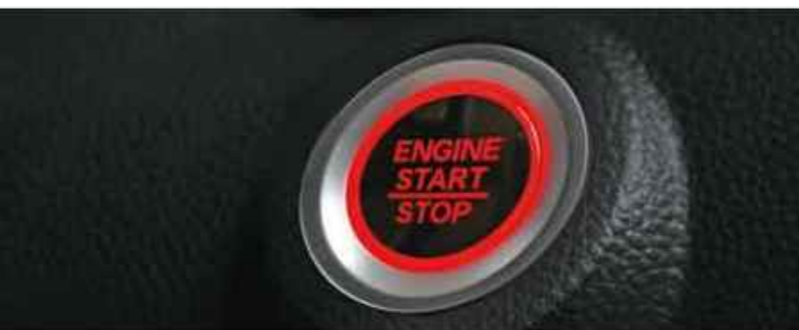
ONE-PUSH ENGINE START / STOP BUTTON

The cabin of the New Amaze extends the external gorgeousness inside and continues to astound. Experience the delightful play of plush interiors with Satin Silver Ornamentation on the dashboard and Satin Silver Garnish on the steering wheel. Appreciate the premium stitching on the seats and enjoy the luxurious ergonomics of an elegantly laid-out cockpit.