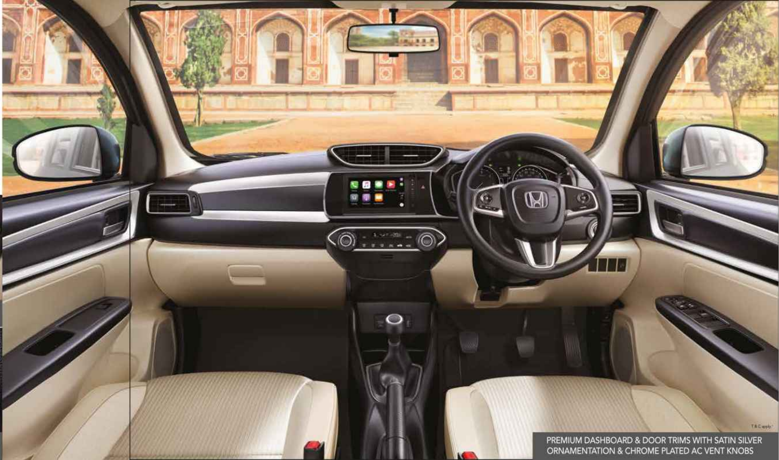
PREMIUM DASHBOARD & DOOR TRIMS WITH SATIN SILVER ORNAMENTATION & CHROME PLATED AC VENT KNOBS