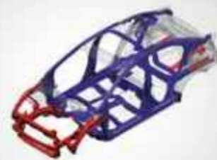
ACE™ BODY STRUCTURE