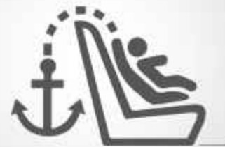
STANDARD ISOFIX SEATS

The safety of the car and the people inside it has always been a priority for every Honda car. The New Amaze is packed with latest features for secure protection.