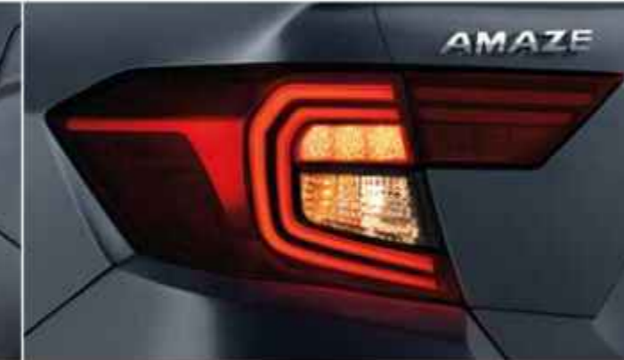
NEW PREMIUM C-SHAPED LED REAR COMBINATION LAMPS