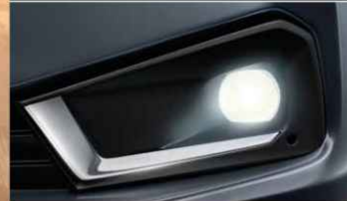
NEW ADVANCED LED FRONT FOG LAMPS WITH SLEEK CHROME GARNISH