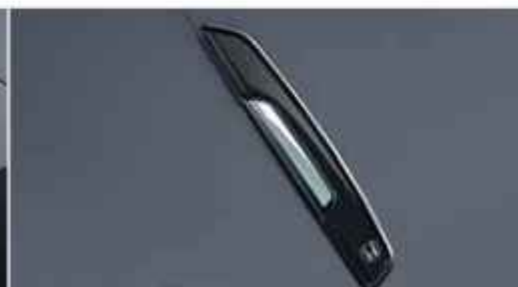
DOOR EDGE GARNISH