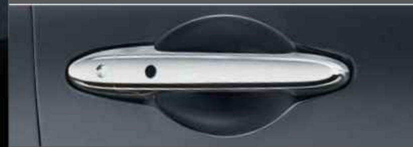
NEW CHROME DOOR HANDLES WITH TOUCH SENSOR BASED SMART ENTRY SYSTEM