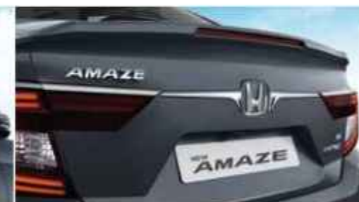
TRUNK GARNISH SLEEK