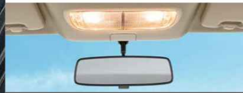
NEW FRONT MAP LAMP