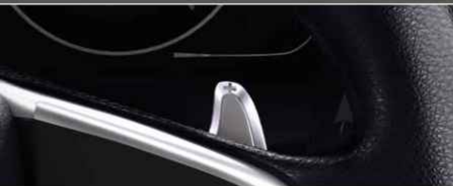
F1 INSPIRED SPORTY PADDLE SHIFT