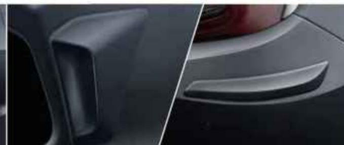
FR/RR BUMPER PROTECTOR