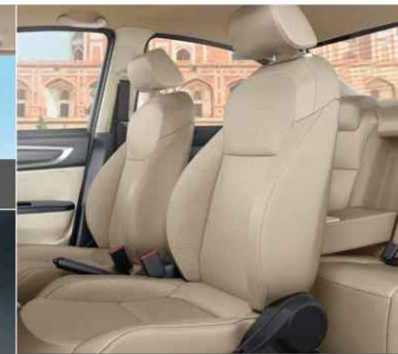
CONTOURED BUCKET SEATS & PREMIUM FABRIC WITH STITCH