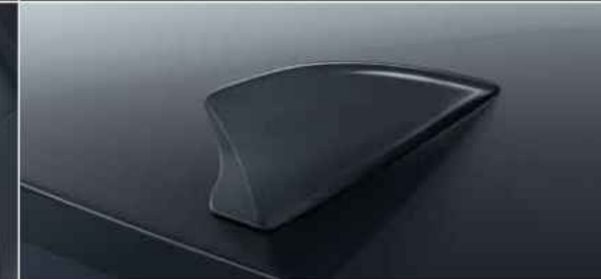
SHARK FIN ANTENNA