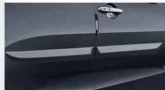
BODY SIDE MOULDING