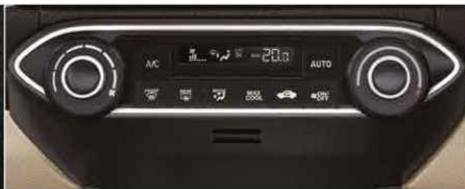
AUTOMATIC CLIMATE CONTROL