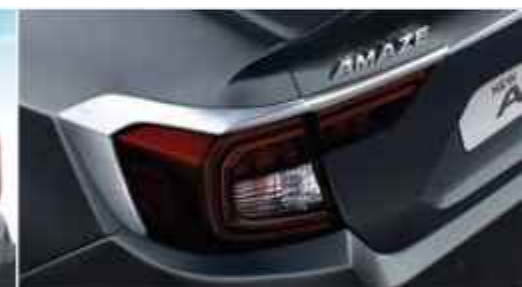
TAIL LAMP GARNISH