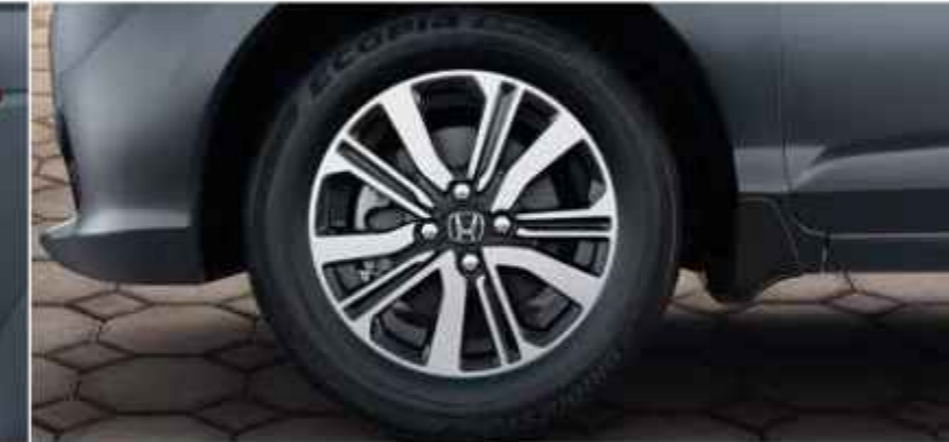
NEW DIAMOND-CUT TWO-TONE MULTI-SPOKE R15 ALLOY WHEELS