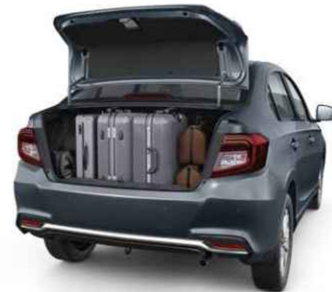
420 Litres BIG BOOT SPACE WITH TRUNK LID LINING

In the New Amaze, energising comfort is refreshingly crafted into every journey. You can easily lounge in the spacious, roomy cabin that has ample legroom. Relax. Let go. And give in to uninterrupted satisfaction.