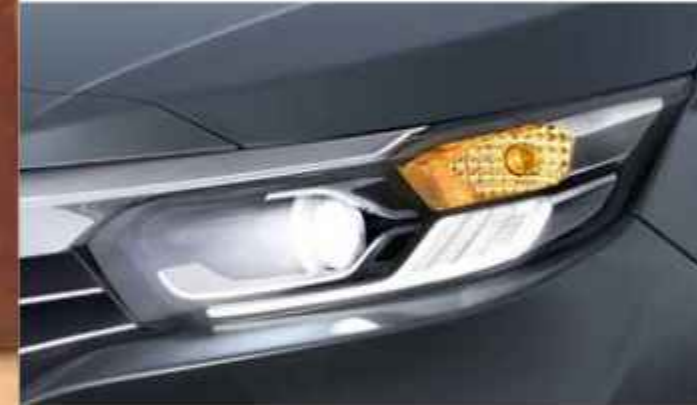
NEW ADVANCED LED PROJECTOR HEADLAMPS WITH INTEGRATED SIGNATURE LED DRLs

A first look at the New Amaze, and you'll notice a new attitude, a fresh confidence. The strikingly handsome Sleek Solid Wing Face Front Chrome Grille with Fine Chrome Moulding Lines. The winsome gaze of sleek, stylish LED Projector and DRL Headlamps. The uniquely stunning new Premium C-Shaped Rear Combination Lamps. Mesmerise the world with your brilliance.