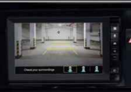
NEW REAR MULTI-VIEW CAMERA WITH GUIDELINES