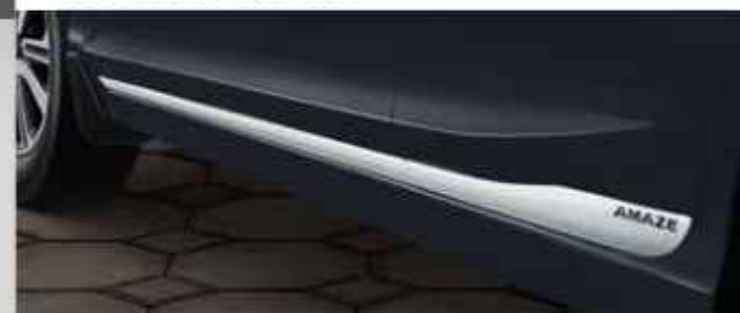
DOOR LOWER GARNISH