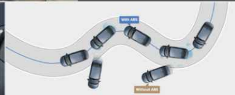
STANDARD ABS WITH EBD