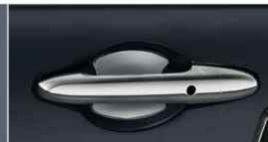
DOOR HANDLE PROTECTOR