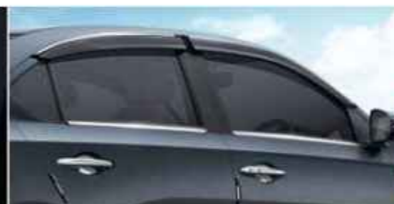
WINDOW CHROME MOULDING