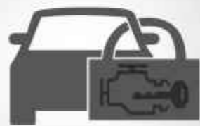
ECU IMMOBILIZER SYSTEM