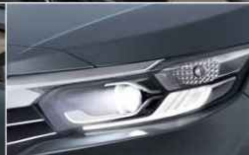
NEW AUTOMATIC HEADLIGHT CONTROL WITH LIGHT SENSOR