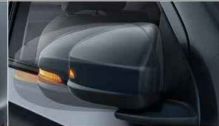
POWER ADJUSTABLE & FOLDABLE ORVM